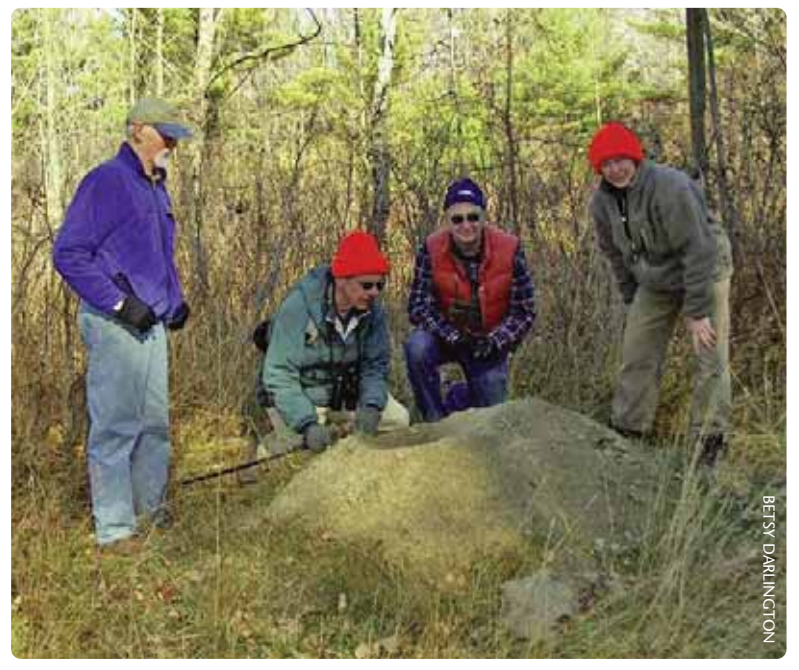
As their common name would imply, Formica exsectoides build large thatched mounds that can be up to fifteen feet in diameter and four feet high. The mound pictured above at the Steege Hill Nature Perserve shows evidence of a recent Black Bear visit.

Their common name would seem to suggest a special affinity with Pennsylvania, but the species is widespread in eastern North America from Nova Scotia to Georgia. (The ants can be found at the Land Trust's Plymouth Woods Nature Preserve and a conservation easement in Big Flats, as well as on Steege Hill.) Their