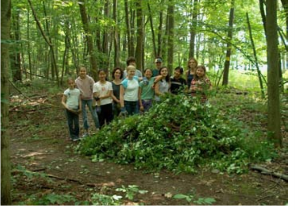
Land Trust volunteers and their "haul" after removing Asian Bittersweet at the Ellis Hollow Preserve.

Learning to tell the "bad green things" from the "good green things" is of course the first step. After that, it makes sense to get a good handle on the problem - understanding what is going on both on your property and in the surrounding landscape - and then make decisions regarding what might or might not be practical and effective in terms of control. Only a handful of NNIPs currently have biological controls, so most problem plants have to be treated manually (ex. pulling), mechanically (ex. mowing), or through the careful use of herbicides. Making the decision to attempt a control project is necessarily followed by making a decision as to how to go about it. In many cases, a combination of approaches will be the most effective. Sometimes, use of herbicides cannot be